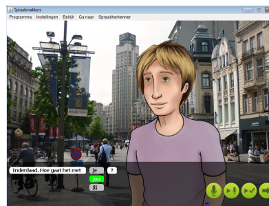
Figure 2 . Morphology exercise

Morphology exercises: a multiple choice approach was recommended. For example, for personal and possessive pronouns: “Hoe gaat het met (jij/jou/jouw)?” (“How are (you/you/your)?”) and for verb inflections: “Hoe (ga/gaat/gaan) het met jou?” (“How (are/is/to be) you?”).