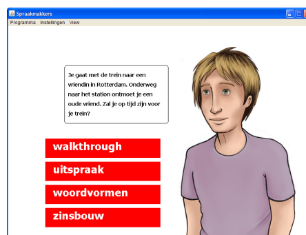
Figure 1. Learners can choose to practice different skills: pronunciation ( uitspraak ), morphology ( woordvormen ) and syntax ( zinsbouw ).

The methodological design of the system led to a relatively simple software architecture that is sustainable and scalable, a straightforward interface that appeals to – and is accepted by – the users (by responding to their subconscious personal goals), a sophisticated linguistic-didactic functionality in terms of interaction sequences, feedback and monitoring, and an open database for further development of conversation trees.