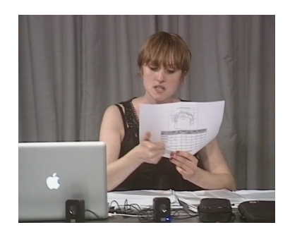
Figure 1: Example of an AM classroom layout. Participants are sitting at a table around the teacher who uses diagrams and meta-discourse to describe the articulation of the different phonemes.

classroom stage was reorganized as follows: for the AM classes, the participants were sitting around an U-shaped table while the teacher was explaining articulatory features, using oro-facial and vocal tract gestures or diagrams (Figure 1). The participants were then asked to repeat one by one the target sound, presented in isolation or in single words. During the second part of the class, they would listen to a dialogue or an authentic document, before answering a few questions on the audio documents.