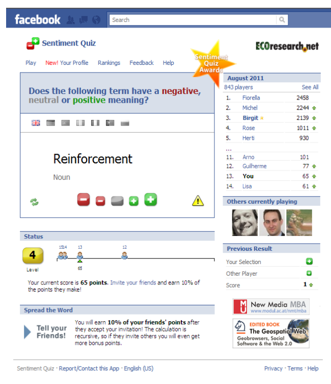
Figure 2. Sentiment Quiz Dictionary Extension

This paper shows how games with a purpose can addresses existing bottlenecks in language resource acquisition and evaluation (Section 2), including a discussion of incentive schemes and differences in extrinsic and intrinsic motivation of participants. Section 3 outlines principles of game design and how they relate to crowdsourcing tasks. Section 4 exemplifies the use of games for language resource acquisition by building seed sentiment lexicons based on aggregated assessments from Facebook users. Section 5 summarizes the evaluation results and describes the subsequent expansion of seed lexicons through an automated bootstrapping process. Section 6 concludes the paper and suggests an extension of the current approach to support both the acquisition and sharing of language resources.