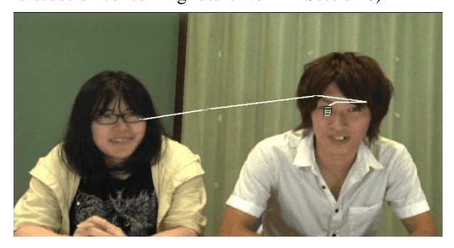
Figure 1: Camera view of the two participants showing a gaze path from left to right and a gaze fixation on the right eye of the right-hand side person.