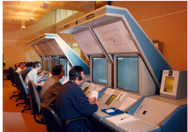
Figure 1: Control room and controller working position at the EUROCONTROL Experimental Centre (recording site)

In most air traffic control centres the controller pilot radio communication is recorded and archived for legal reasons. However, these legal recordings are problematic for a corpus production for a multitude of reasons. First, most recordings are based on a received radio signal and thus not wideband. Second, it is in general difficult to get access to these recordings. And third, even if one would obtain the recordings, their public distribution would be legally problematic at least in many European countries.