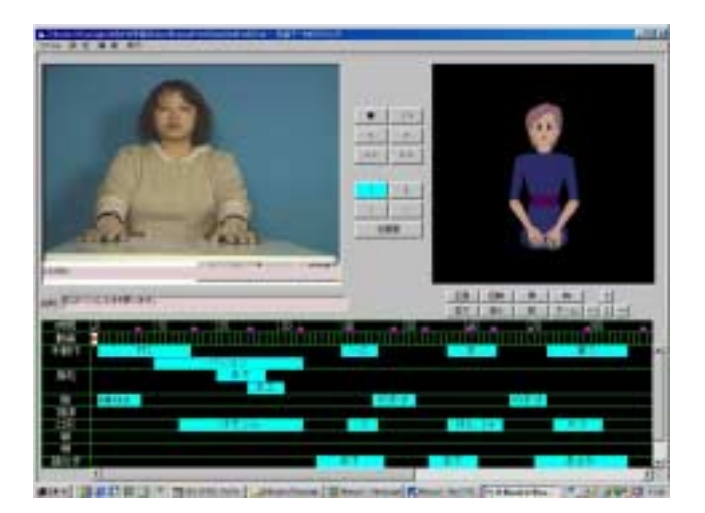
Figure 5.1 Sign-language annotation tool

Video files were reviewed and annotated by native signers and interpreters. Linguistic tags were synchronized with video frames after the annotation.