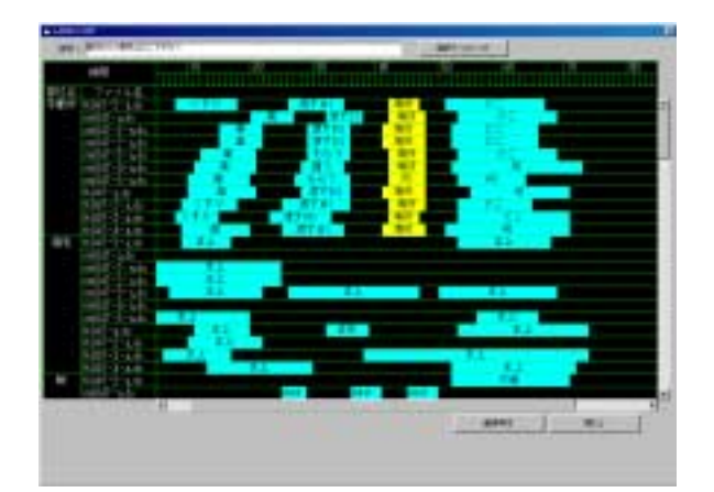
Figure 5.3 Alignment of comparison data

(8) BODY POSTURE (five kinds): move backward, move forward, tilt, move upward, move downward