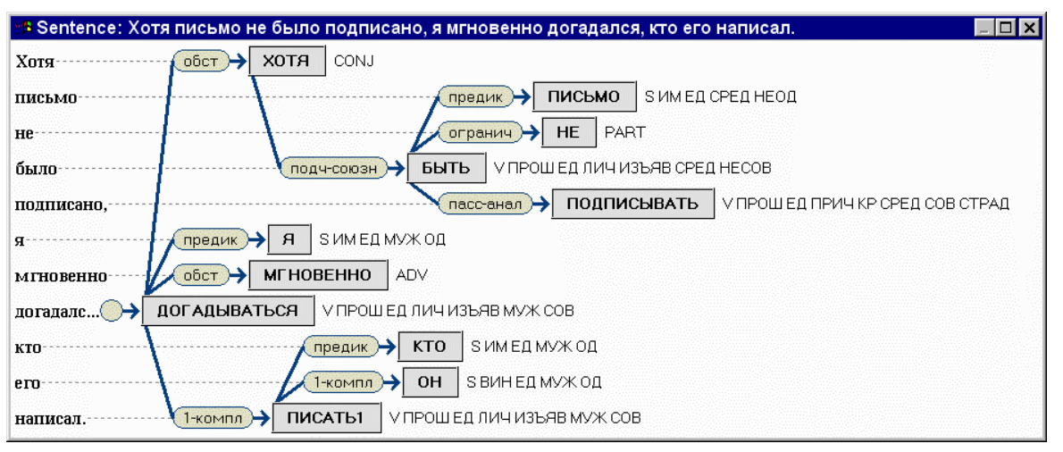
Figure 2. Tree Editor dialog in StrEd.